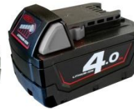
Battery 4.0 Ah 341840