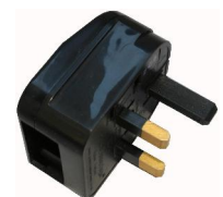
UK-Adapter (EU-GB) 341819

operational field of the cordless shears: see the electric versions 3500, 3550.