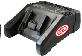
Charger CLi EU 341810